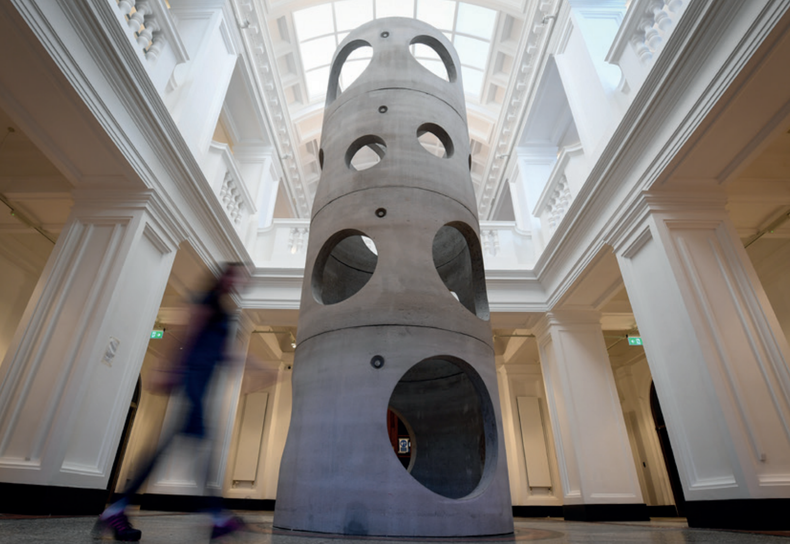
Figurehead II by Alexandre de Cunha.