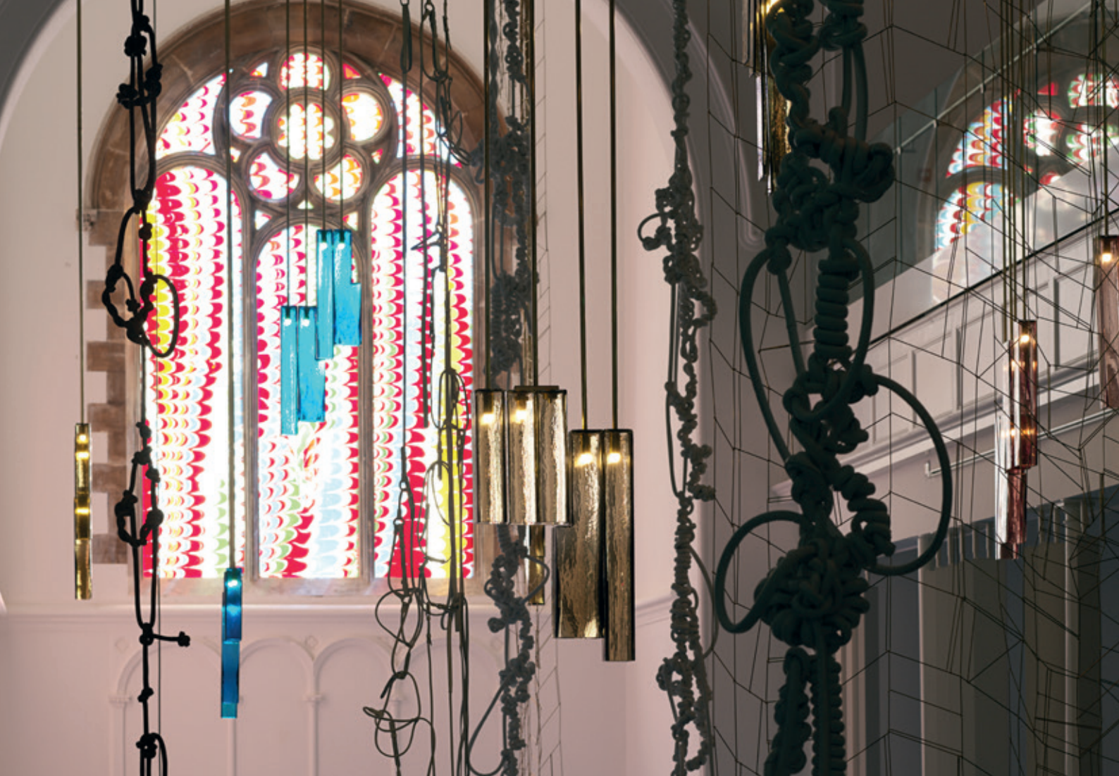
Sequences, inversions and permutations by Leonor Antunes.